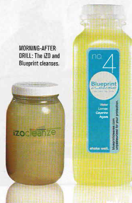
MORNING-AFTER DRILL: The iZO and Blueprint cleanses.